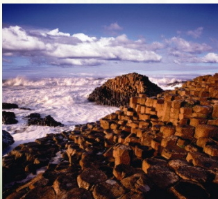
See the Spectacular Giants Causeway in Co. Antrim

*Price is Per Person Sharing – Land Only; Single Supplement: $899.00*